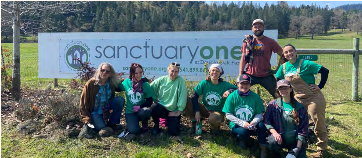
BANYAN EMPLOYEES VOLUNTEERING AT SANCTUARY ONE