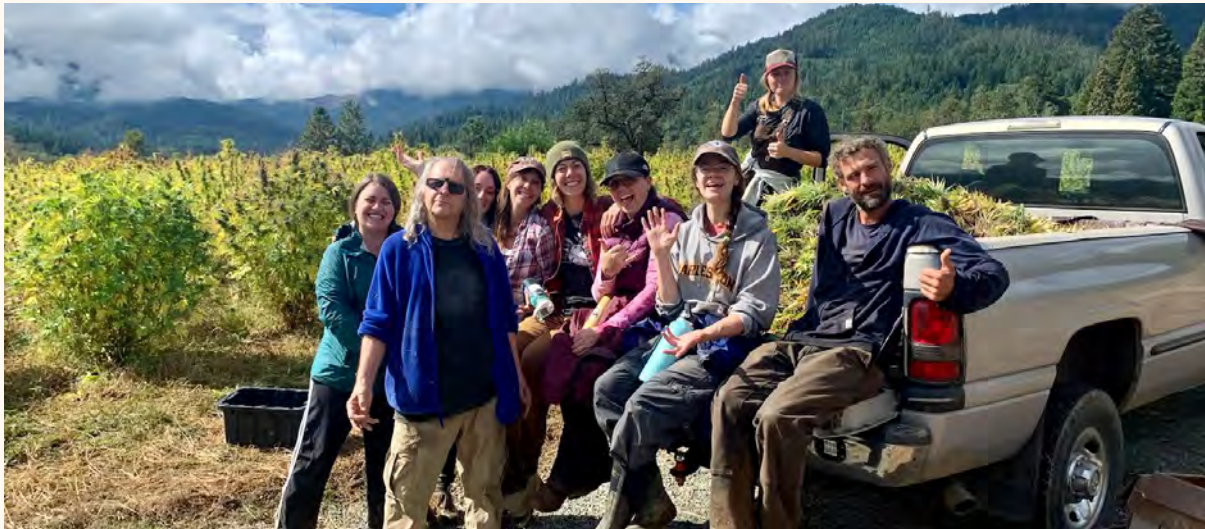
BANYAN STAFF AT SUMMER FARM DAY