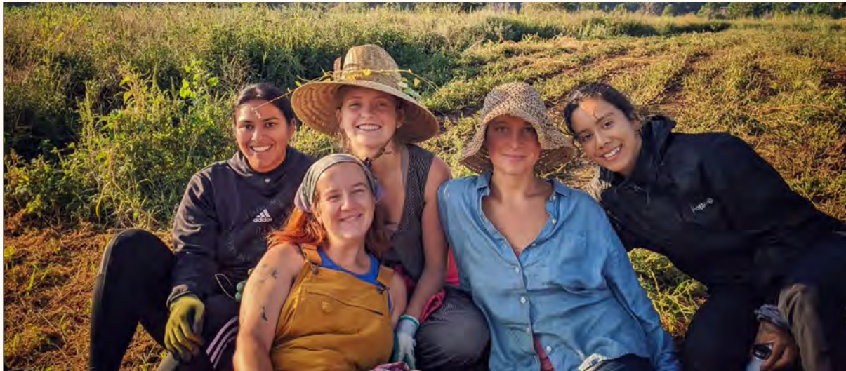
LIVING AYURVEDA INTERNSHIP STUDENTS AT BANYAN FARM