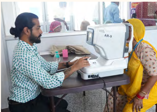
FAIR FOR LIFE-FUNDED MEDICAL SERVICES

• Through the Fair for Life Development Fund, we supported free medical services to communities without access to basic healthcare, including free medicine, medical advice, and preventative doctor's visits.