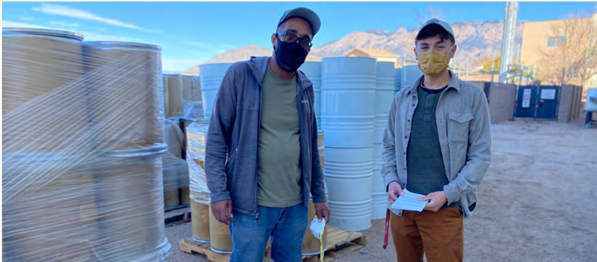
SAFETY SUPERVISOR WITH OIL BARRELS THAT ARE DONATED TO LOCAL FARMERS