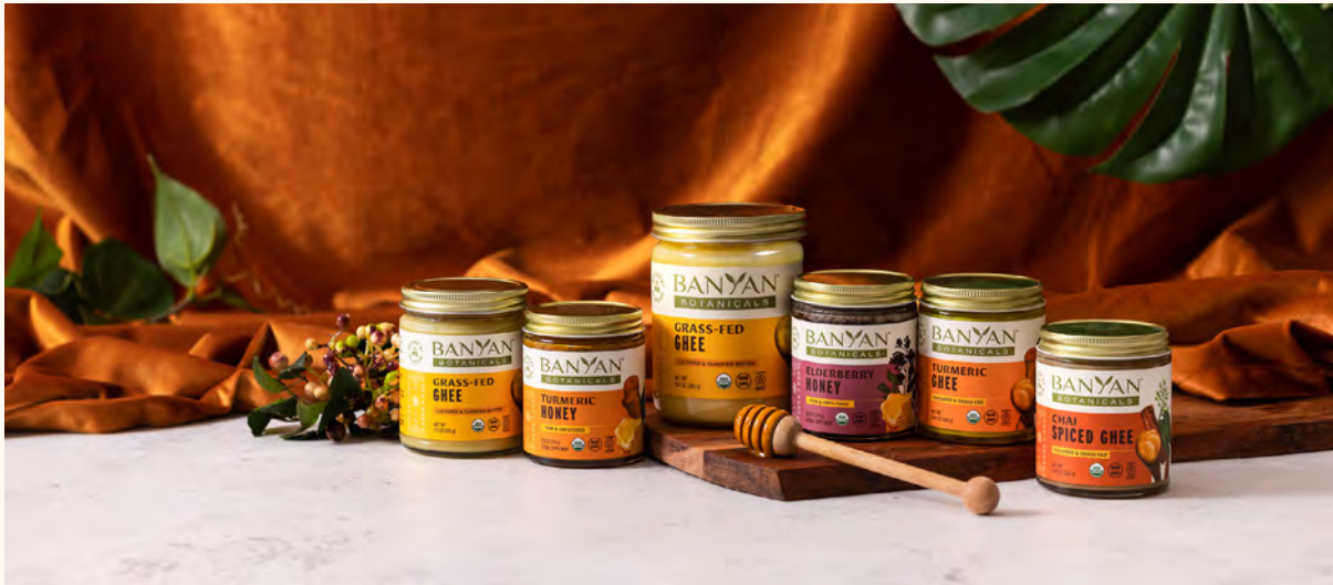
FIVE NEW BANYAN BOTANICALS PRODUCTS RELEASED