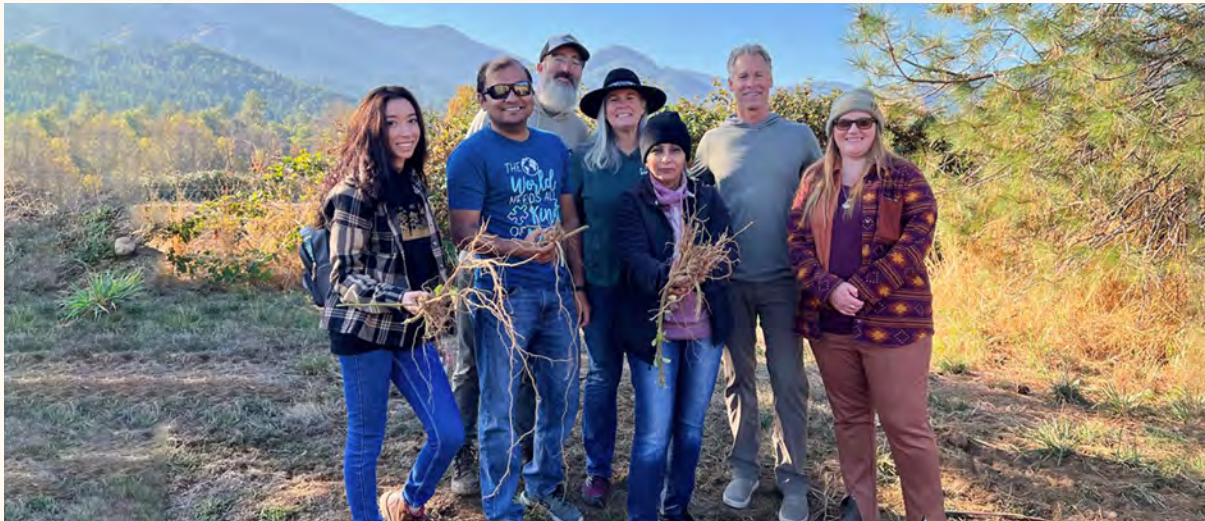
BANYAN STAFF WITH ASHWAGANDHA AT BANYAN FARM